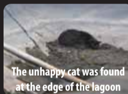
The unhappy cat was found at the edge of the lagoon