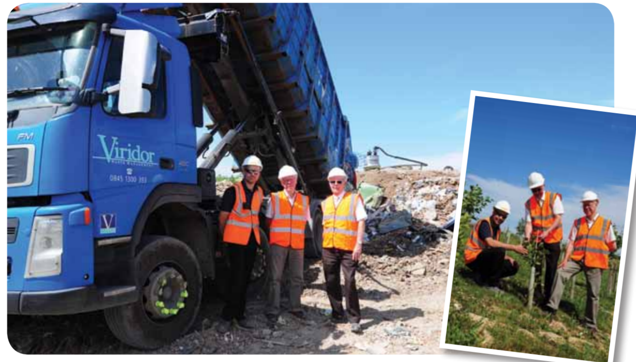
▲ Above: The last load arrives at Horton landfill, which has now closed. Inset: the site will undergo restoration