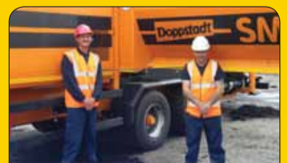
Walpole Compost Unit Walpole, South West Improved door restraint on Doppstadt Screener