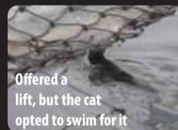
Offered a lift, but the cat opted to swim for it