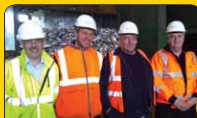
Peterborough MRF Peterborough MRF, South East Baler conveyor safety barrier

THE quarterly Health and Safety Excellence Awards have continued to receive a good level of entries from all over the country. Congratulations to our latest winners – all of whom have been awarded £200 each: