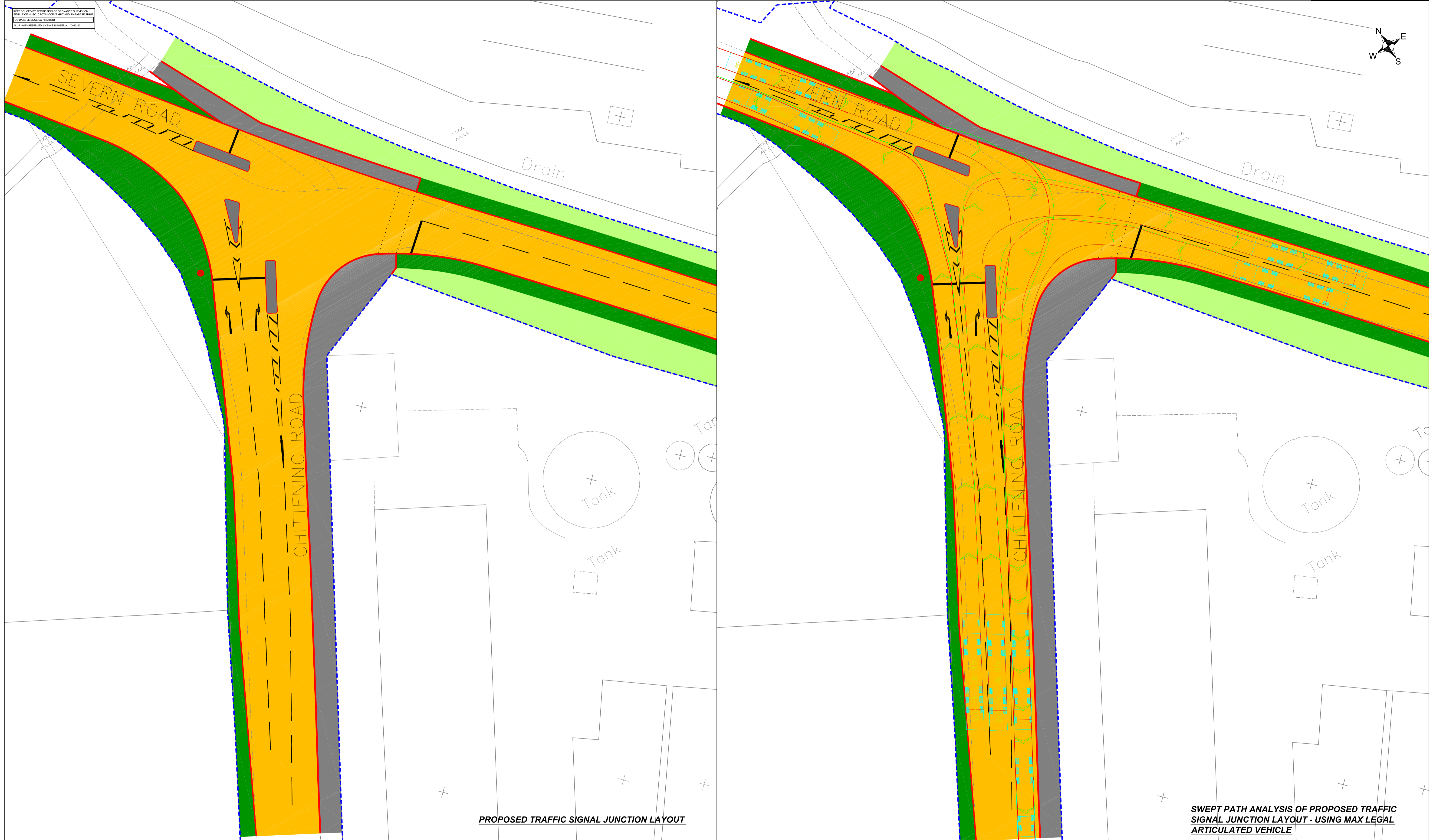
PROPOSED TRAFFIC SIGNAL JUNCTION LAYOUT