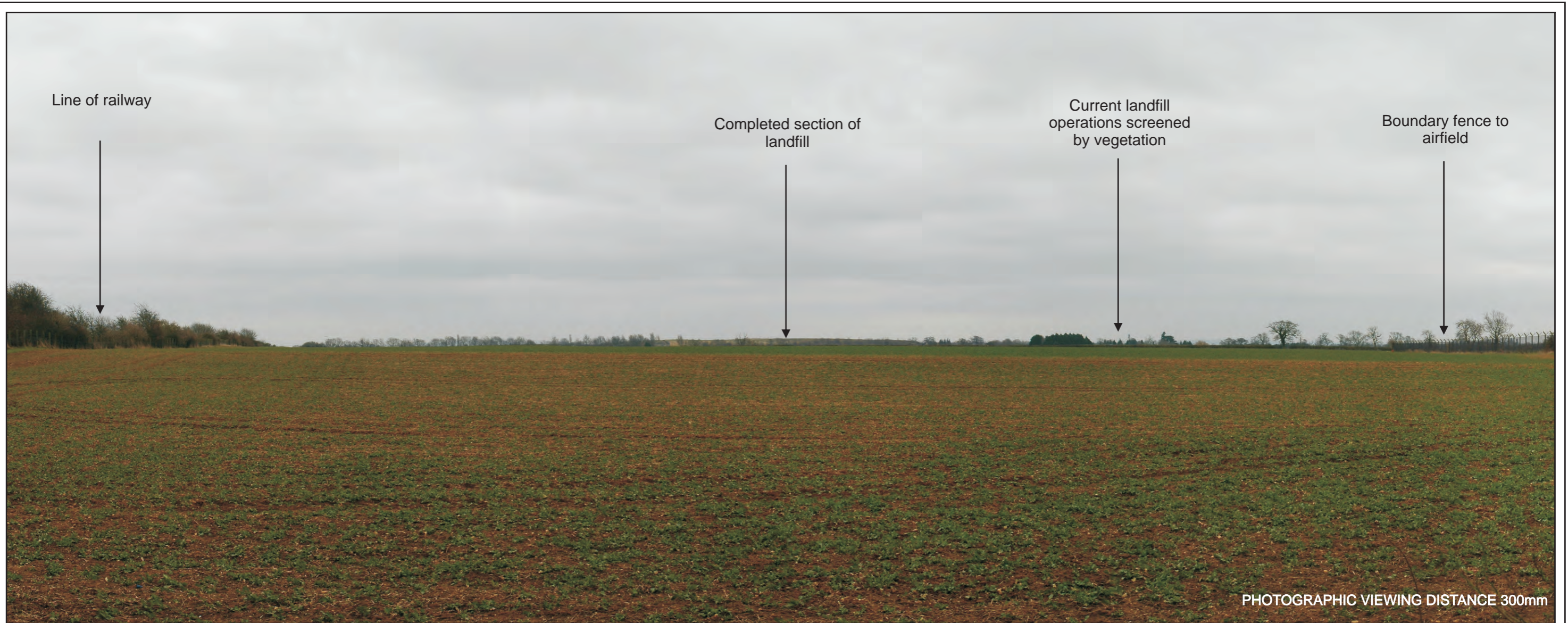
PHOTOGRAPHIC VIEWING DISTANCE 300mm