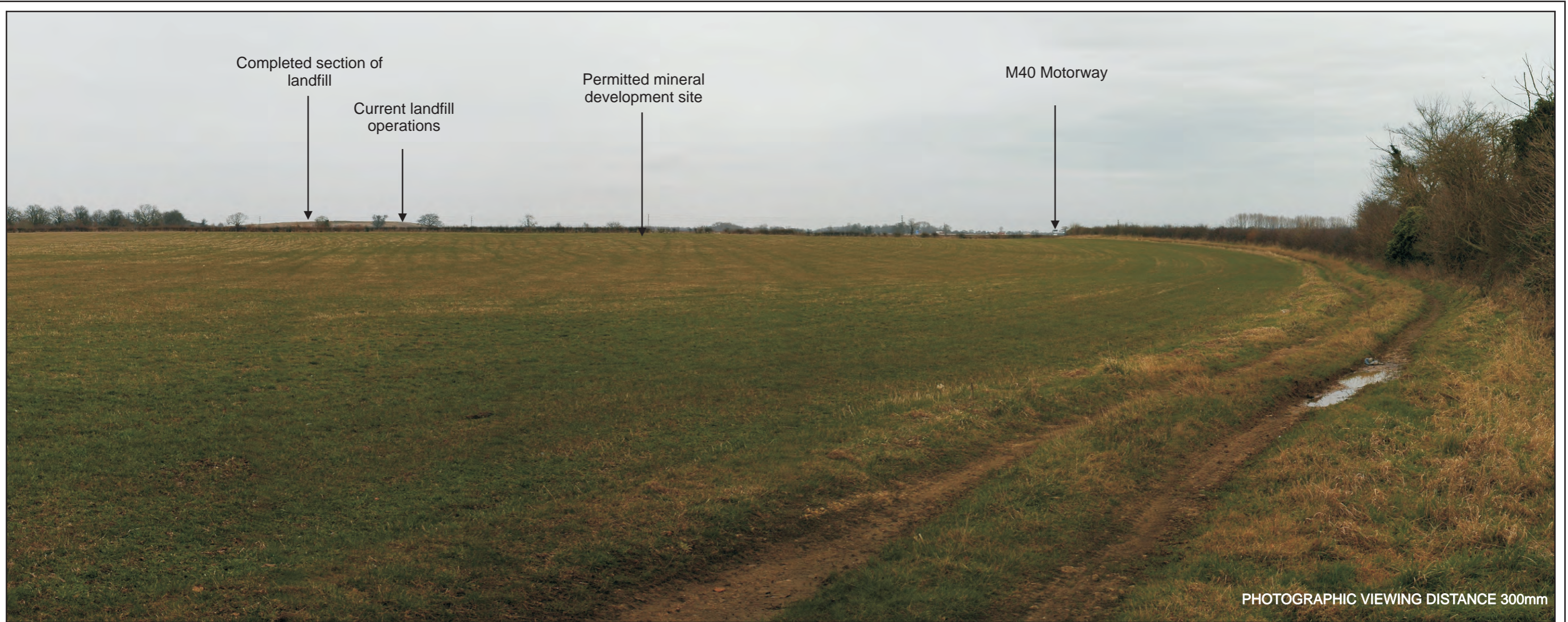
PHOTOGRAPHIC VIEWING DISTANCE 300mm