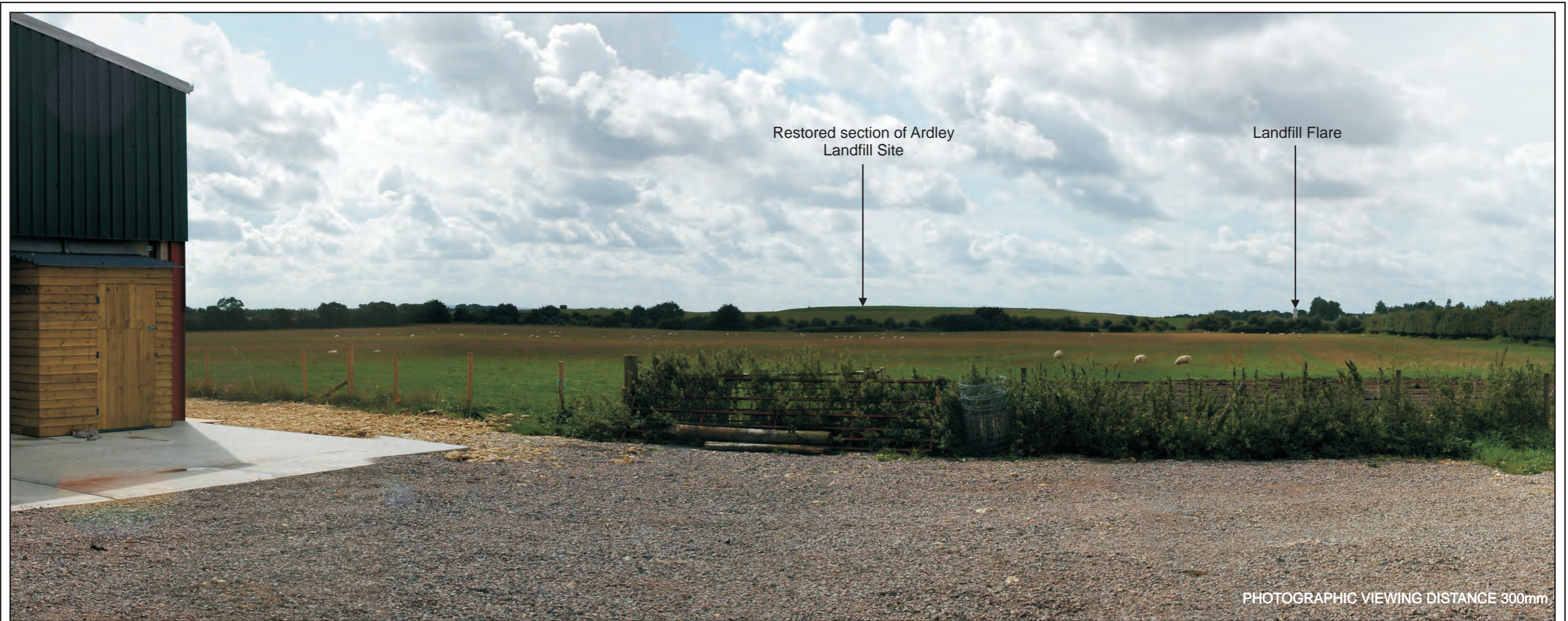
PHOTOGRAPHIC VIEWING DISTANCE 300mm